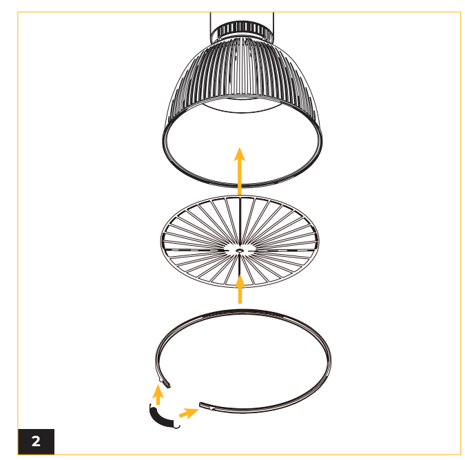
When specifying the conical lens accessory. Cover the shroud with the conical lens plate and fasten in place using the provided metal band.

Clean the interior and exterior surface using a soft rag with water.